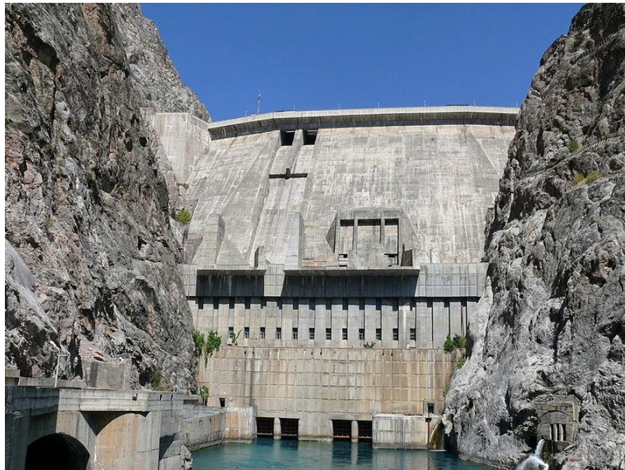
Picture 1. Toktogul hydropower plant dam